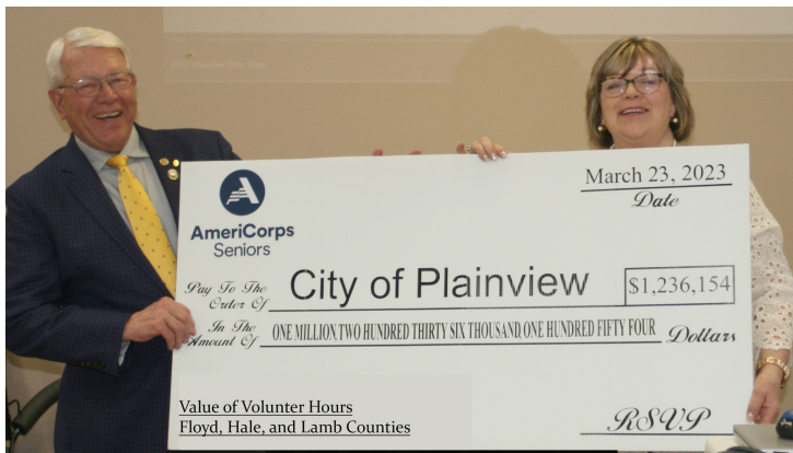
Value of Volunteer Hours $1,236,154.00