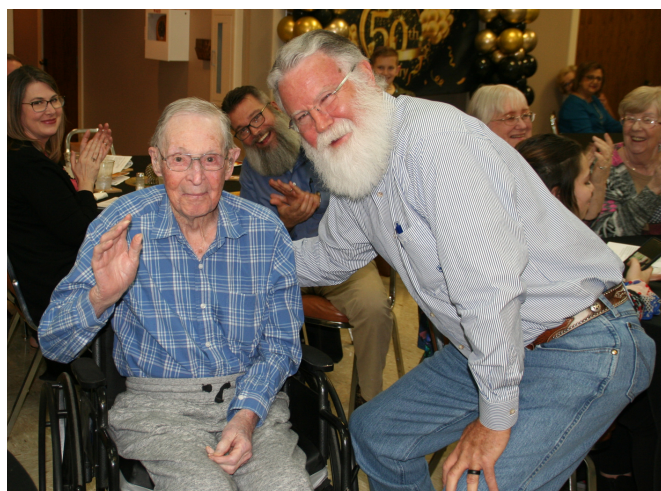
Service With A Smile 2022 Daryl Dixon