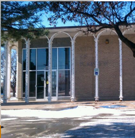
Proposed New Police Department Location