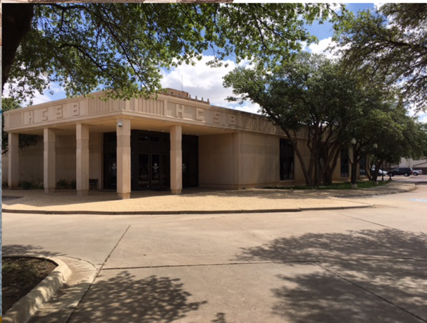
Proposed New City Hall Location

Police Department Project Details on next page